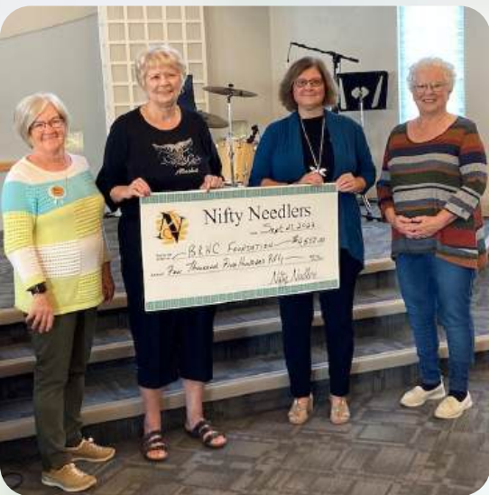
(Left) The Nifty Needlers raised $4550 to purchase 2 commodes for the 400/500 Medical Units here at the BRHC.