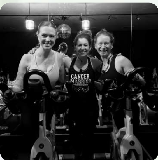
(Left) Tour Fit Club raised $990 for the BRHC Palliative Care Unit.