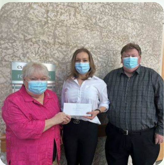
(Left) The Order of the Eastern Star raised $1000 for the BRHC NICU