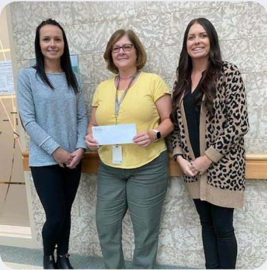
(Left) The 12th Annual Birdies for Brain Tumours Golf Tournament raised $3850 for the Western Manitoba Cancer Centre