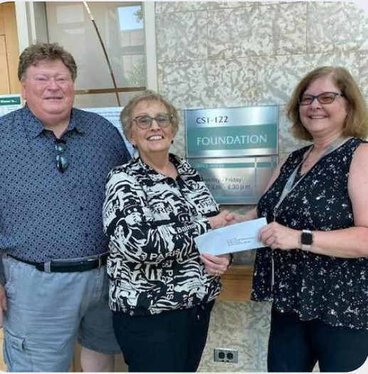
(Left) Order of the Eastern Star Grand Chapter of Manitoba raised $2404.55 for the BRHC NICU