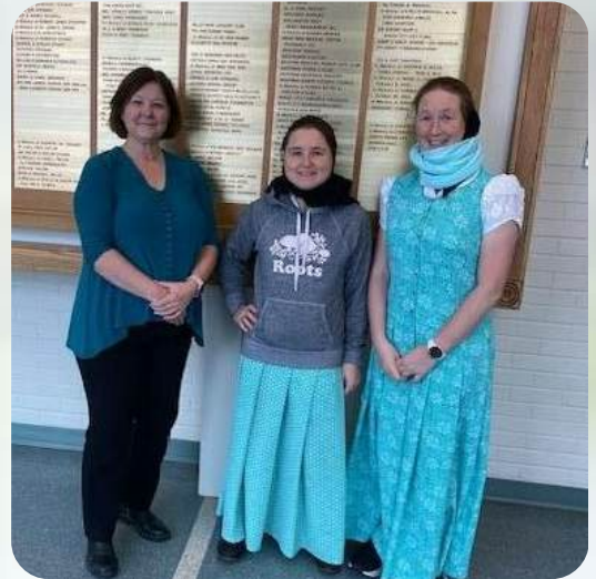
(Below) "Country Girls" donated $495 towards the Western Manitoba Cancer Centre