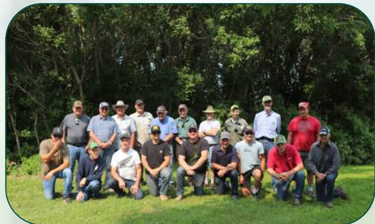
(Above) Rivers Tractor Trek raised $2350 towards the Western Manitoba Cancer Centre