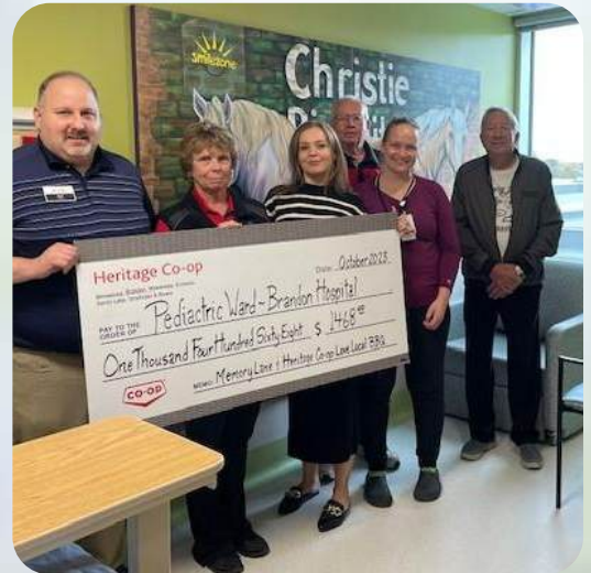
(Above) Heritage Co-op raised $1468.45 for the BRHC Pediatrics department