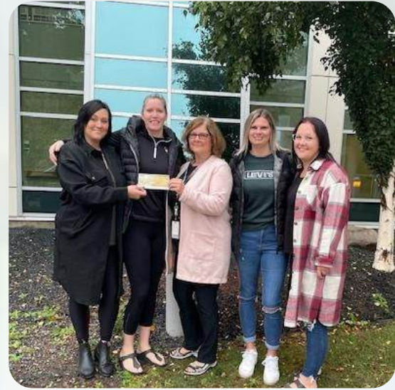
(Below) The Pinkest Owl 30th annual golf tournament raised over $18 000 for the Western Manitoba Cancer Centre